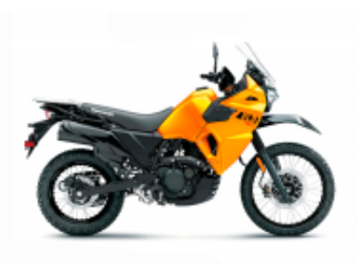
KLR 650 + R$ 3.688,81