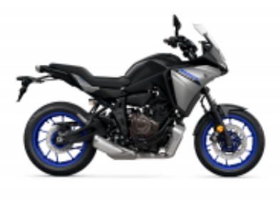
Tracer 700 + $57.80