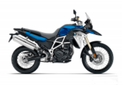
F 800 GS + R$ 7.370,46