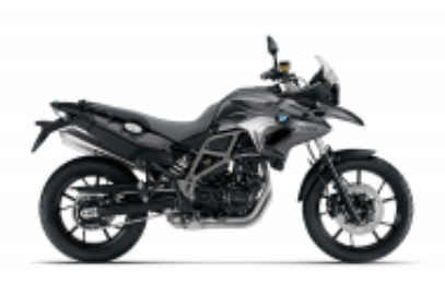
F 700 GS + R$ 3.275,76