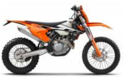
EXC 450 + $0.00