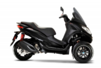
MP3 300 + £0.00