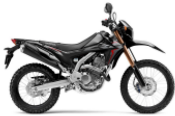
CRF 250 L + $770.52