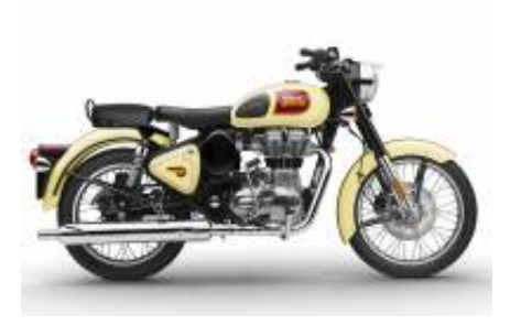
Classic 500 + £0.00