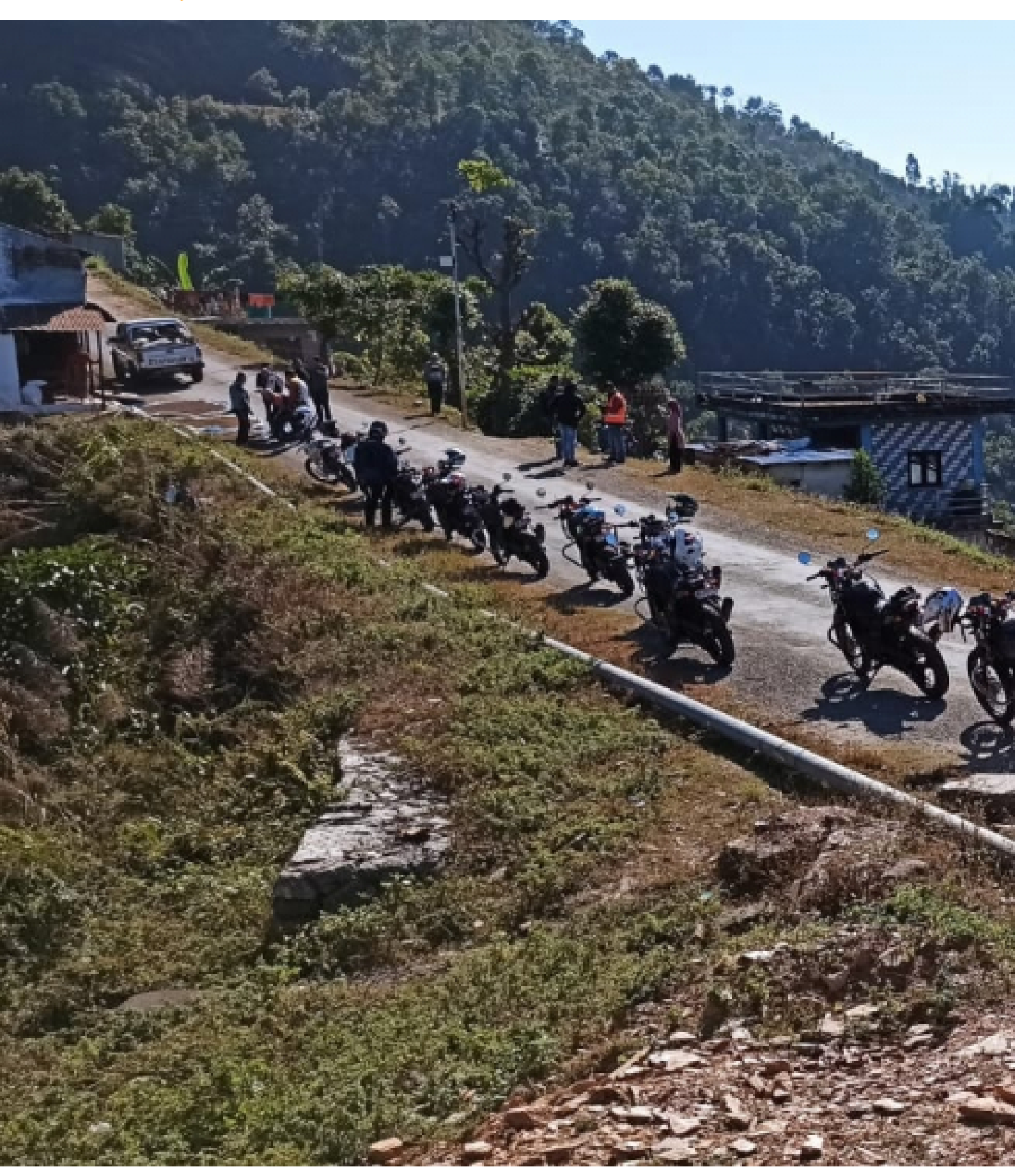
Motorcycle dual-purpose and Adventure Nepal, Mustang challenge