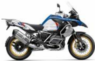
R 1250 GS Adv LC + 112.08.-