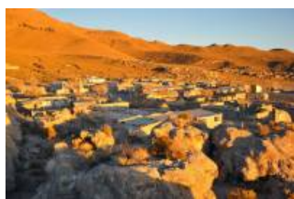
7 - Turismo San Juan - Laguna Colorada - 420

Definitely. this day is the most beautiful moment because we will be driving over the Great Salar of Uyuni. where we will have some spectacular and beautiful places to take unique photos of this trip. This day we'll cross the Salt Flat from one end to the other, arriving at a town called San Juan at 3,800mts. where we'll stay at a basic hostal.