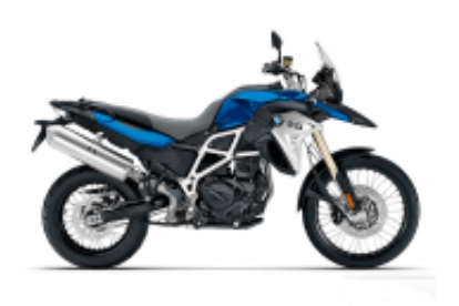
F 800 GS + $400.00