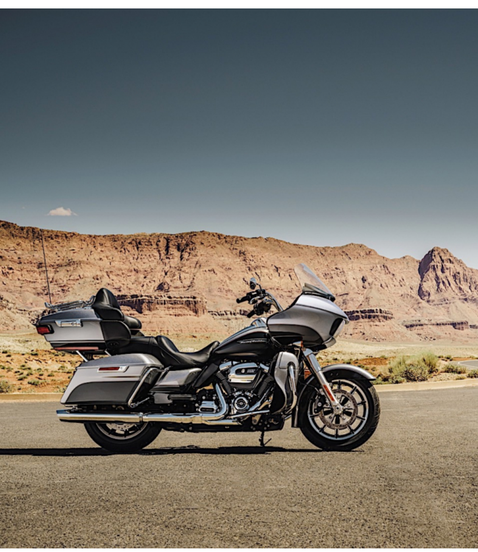
Gran Turismo or Harley Half Route 66 Motorcycle Tour self guided