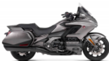
Goldwing DCT 2018 + $673.58