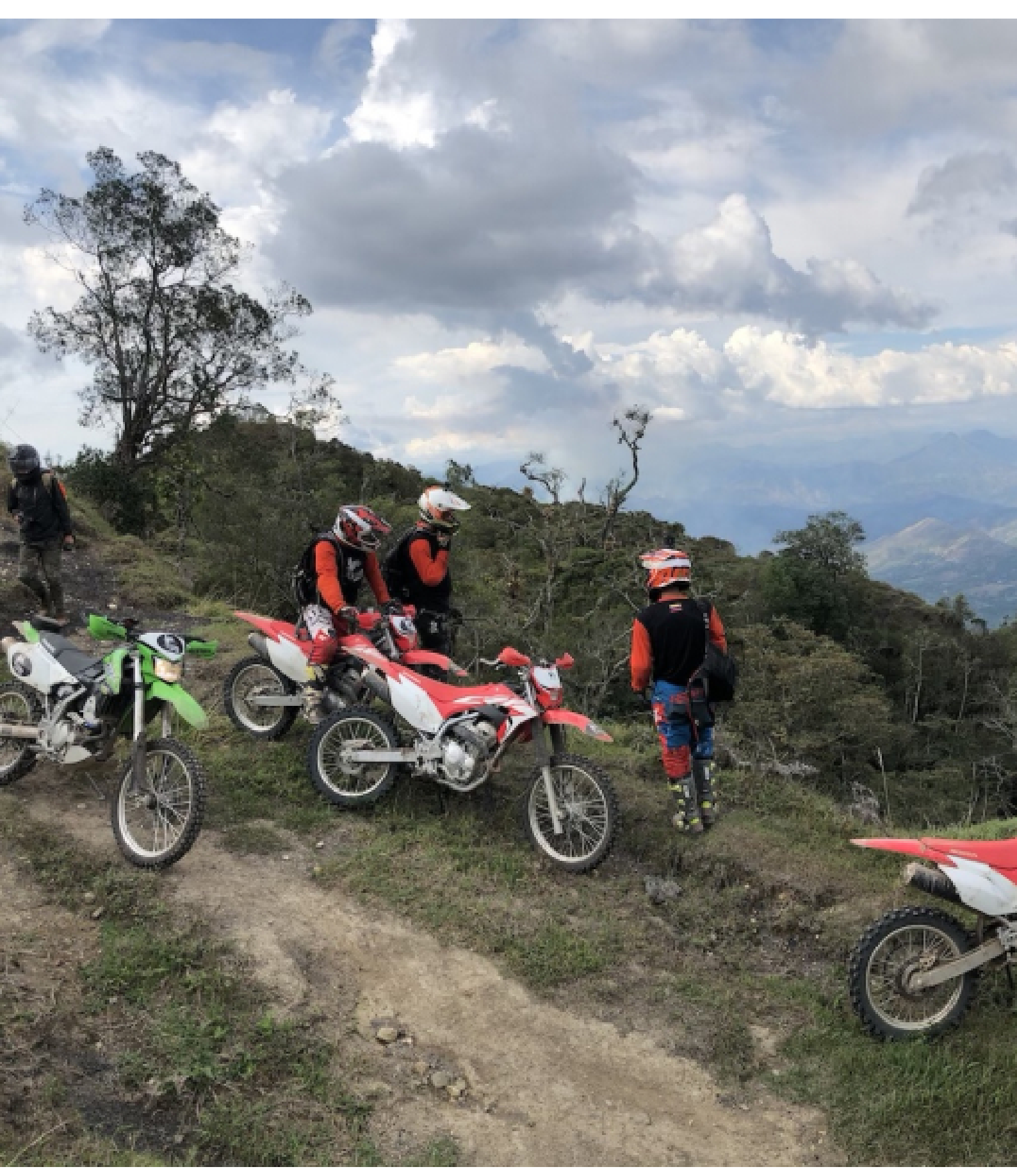
Enduro or Off road motorcycle trip in the heart of Colombia