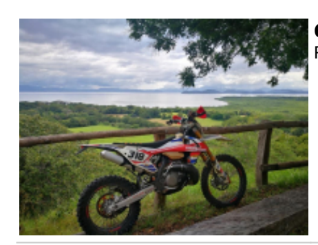
6 - Honda - Honda - Rest Day in Honda.