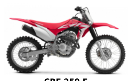
CRF 250 F + R$ 0,00