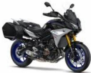
MT 09 847 + 430,00 €