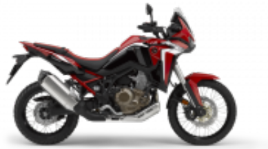
Africa Twin CRF 1100 L + 430,00 €