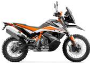
790 Adventure + $0.00