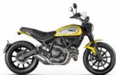
Scrambler Icon 800 + ¥42,145