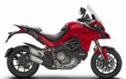
Multistrada 1260 + ¥84,291