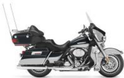
Road Glide Ultra Grand Touring Class + $950.67