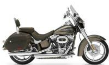
Softail + $950.67