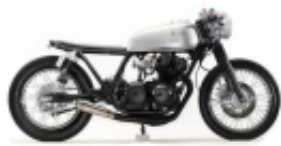
CB 250 Cafe Racer + ¥0