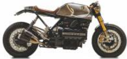
K 100 RS Caferacer + ¥0