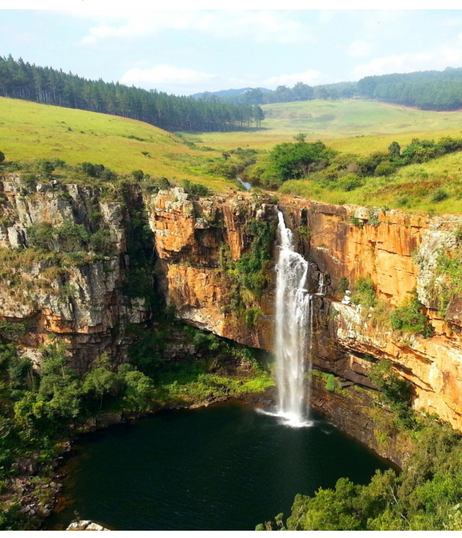
Motorcycle dual-purpose and Adventure South Africa Mpumalanga