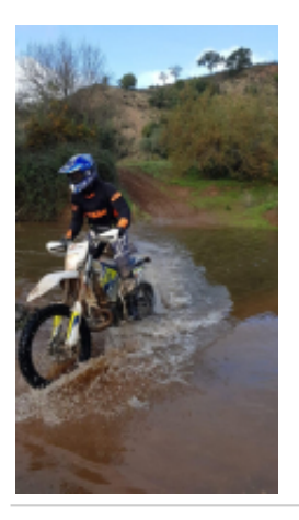
6 - Faro - Faro - 0 transfer to Faro airport.