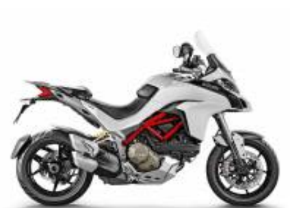
Multistrada 1260 V4 + $0.00