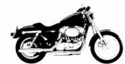
Rally 300 + 0.00.-