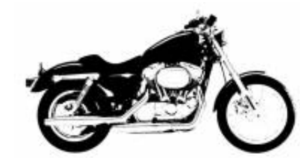
Rally 300 + 0,00 €