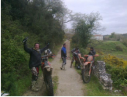
2 - Santarem - Santarem - 160 km