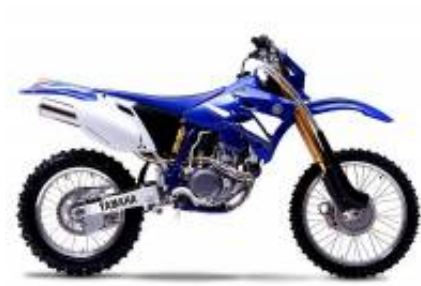
WR 450 + $0.00