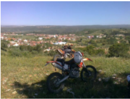
3 - Santarem - Santarem - 150 km