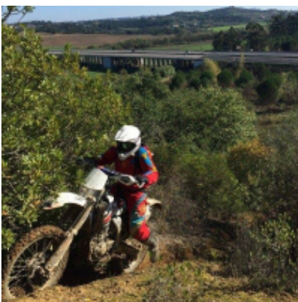
5 - Santarem - Santarem - 140 km