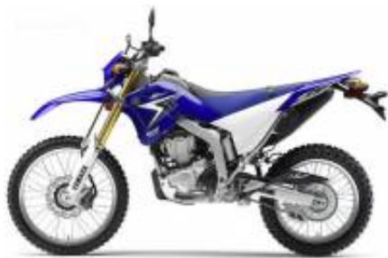
WR 250 + $0.00