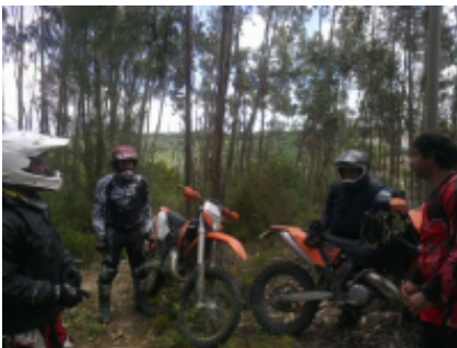
4 - Santarem - Santarem - 160 km