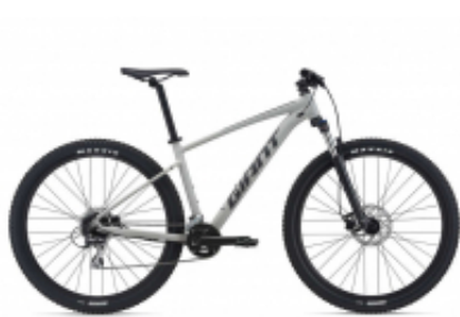
Talon 2 29 + $189.67