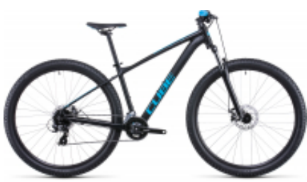
AIM 29er + $189.67