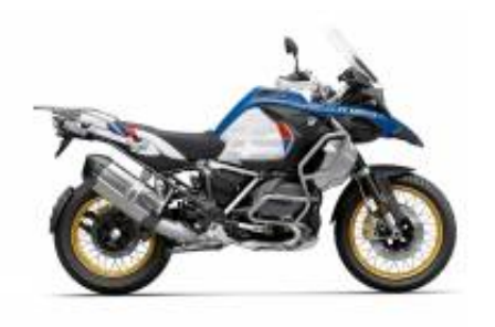
R 1250 GS Adv LC + $231.67