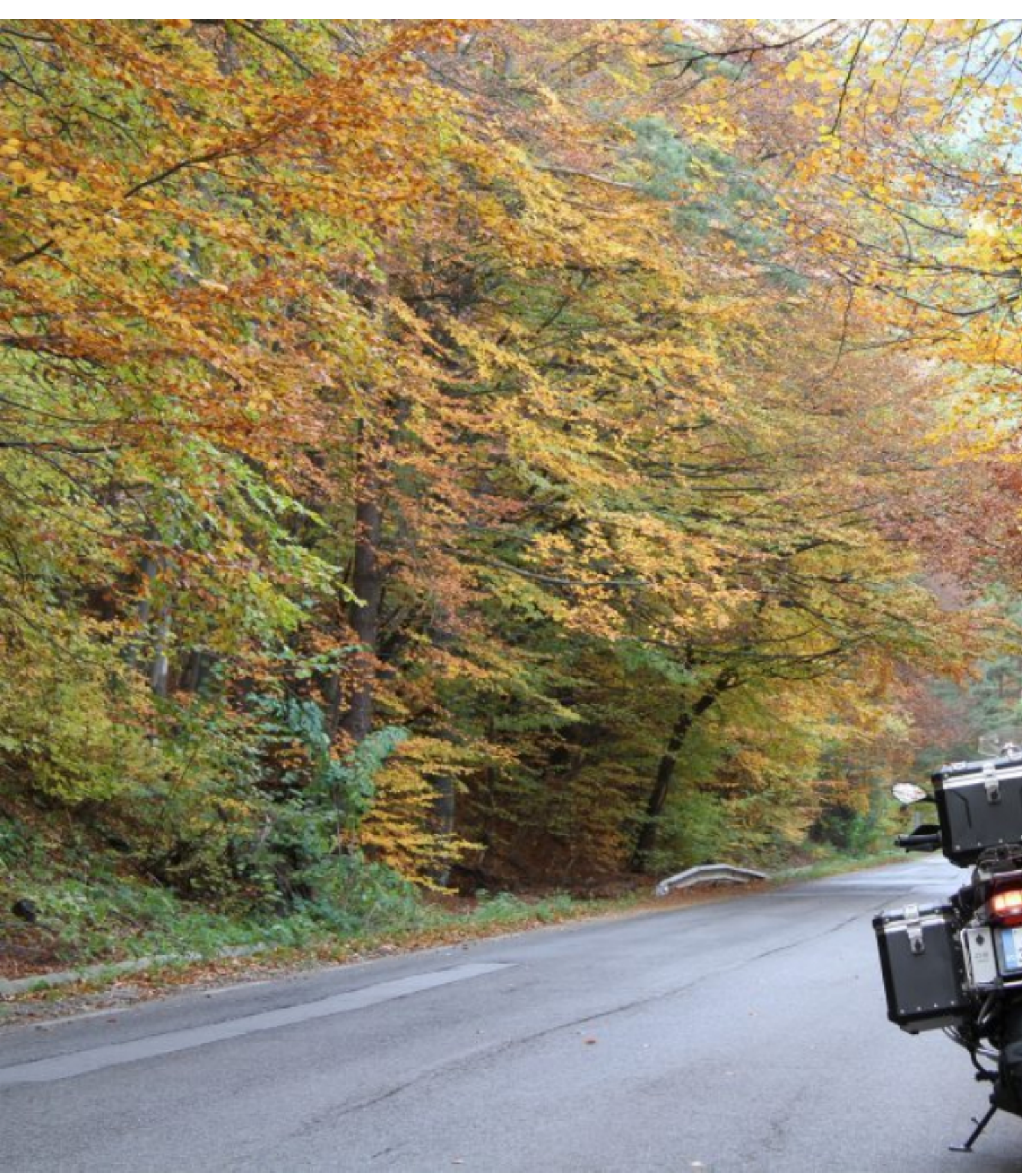
Motorcycle dual-purpose and Adventure Bulgaria on a BMW.