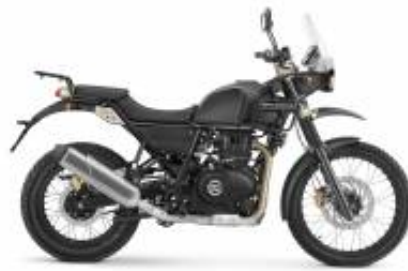
Himalayan 411 + 300,48 €