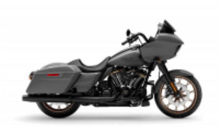
Street Touring Road Glide + $0.00