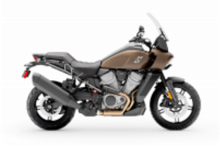
Pan America 1250 + $0.00