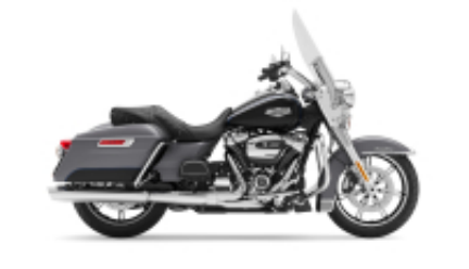
Road King Street Classic Class + $0.00