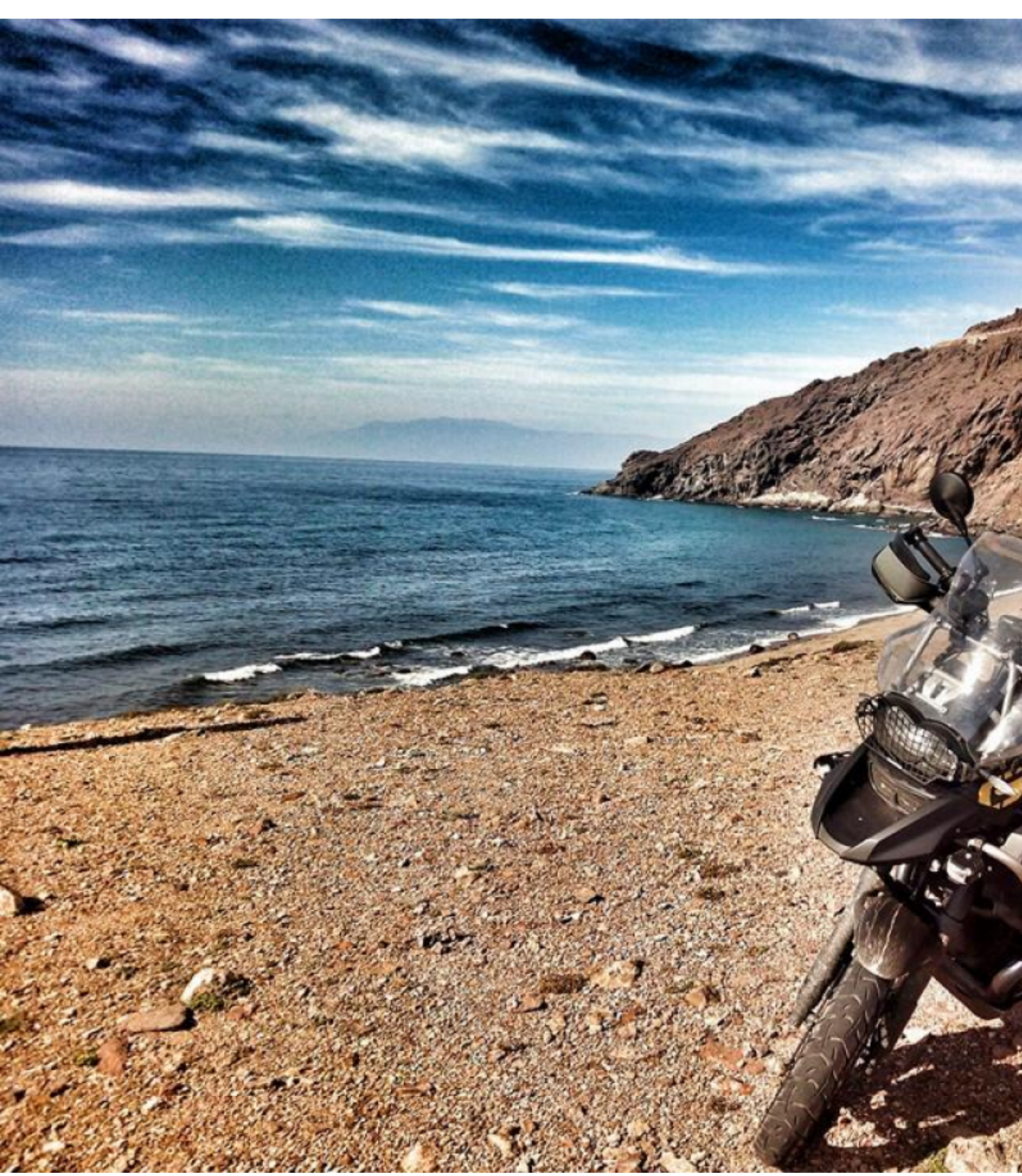
Motorcycle dual-purpose and Adventure The best of Andalucia