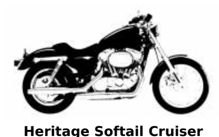
+ R$ 0,00