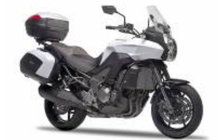
Versys 1000 Grand Tourer + $333.61