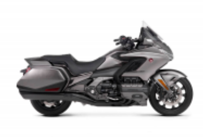
Goldwing DCT 2018 + $673.01