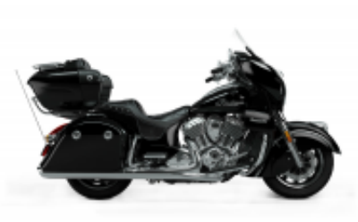
Roadmaster 1890 Grand Touring Class + $673.01