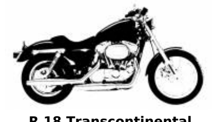
R 18 Transcontinental + $673.01