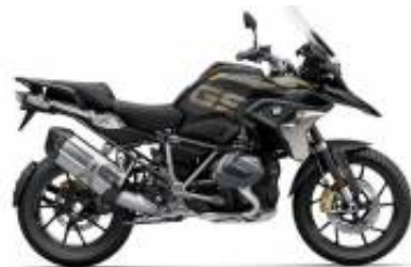
R 1250 GS LC + R$ 3.177,01