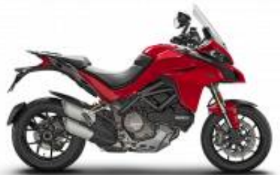
Multistrada 1260 + R$ 3.177,01