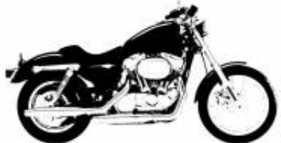
Multistrada V4 + R$ 3.177,01