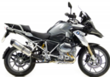
R 1200 GS LC + R$ 2.859,30