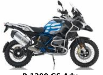
R 1200 GS Adv + ¥41,296