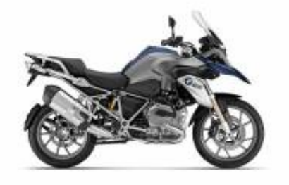
R 1200 GS + ¥41,296