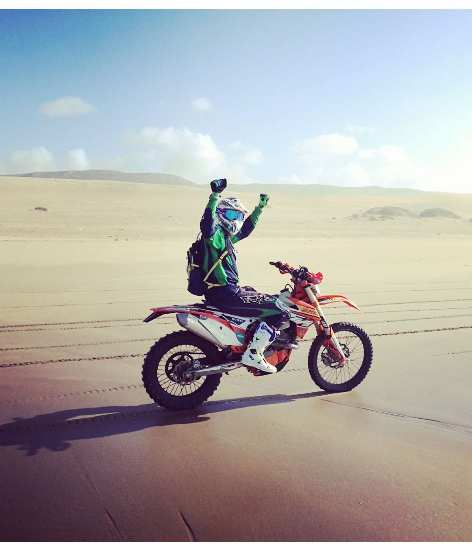
Motorcycle Tour in South Morocco: Off-Road in Agadir