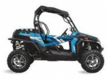
CF MOTO Z-FORCE EX 4x4 + $693.59