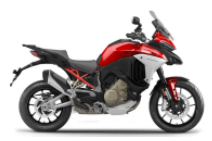
Multistrada V4 + R$ 0,00