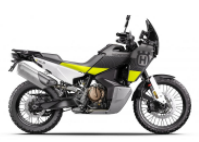
Norden 901 + R$ 0,00