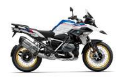
R 1250 GS HP Edition + R$ 0,00