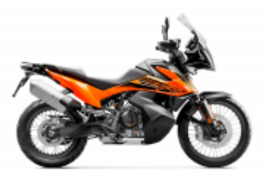
890 Adventure + R$ 0,00