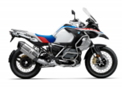
R 1250 GS Adventure + R$ 0,00