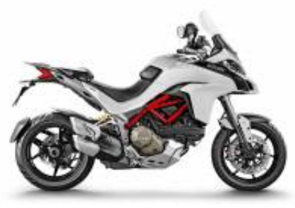
Multistrada 1260 V4 + R$ 0,00