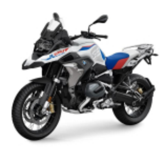
R 1250 GS Rally + $5,121.20