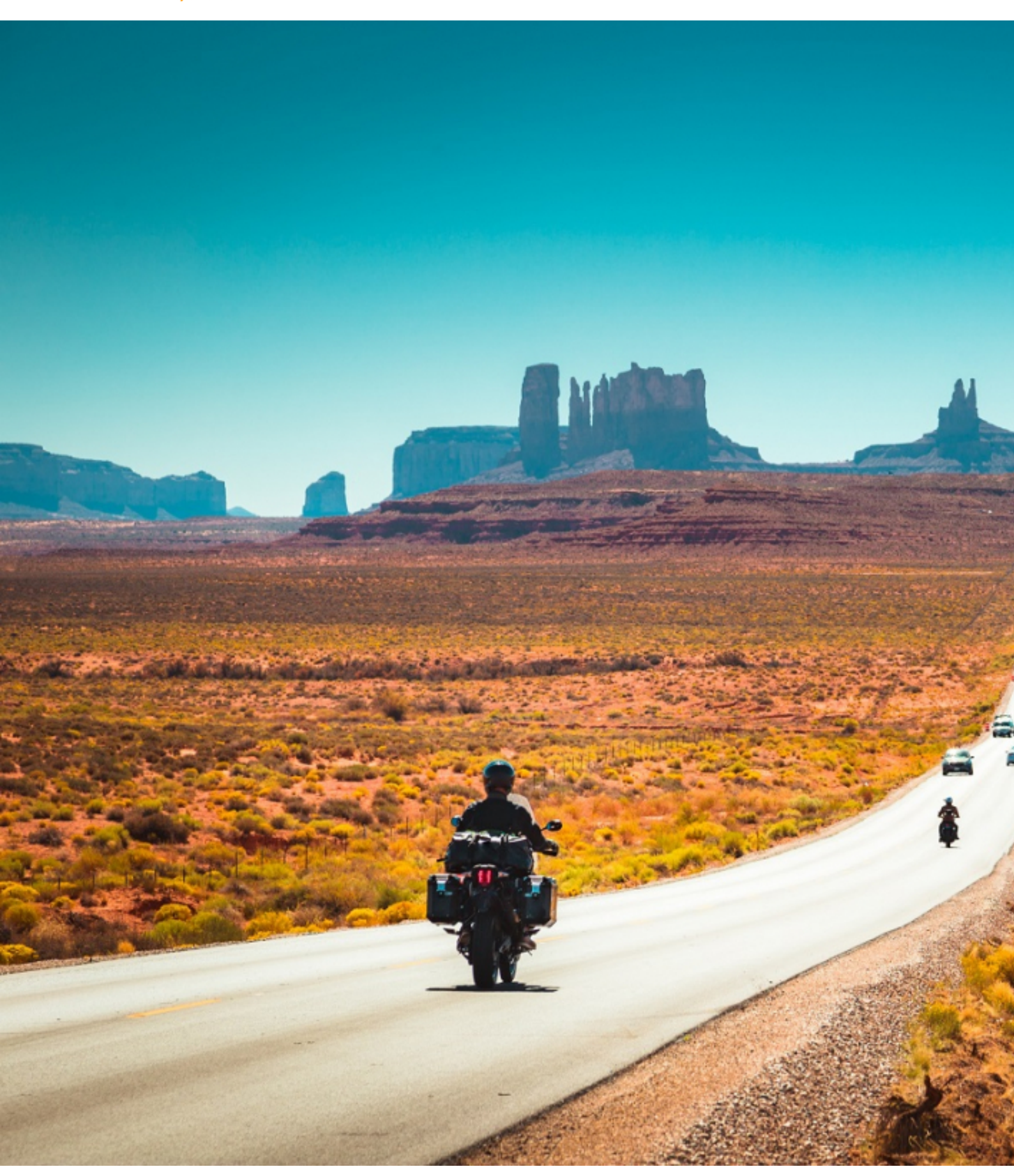
Motorcycle touring and cruiser tour short Wild West I english guided