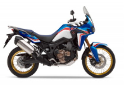
Africa Twin CRF 1000 L + ¥67,341