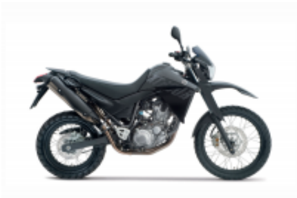
XT 660 + ¥0