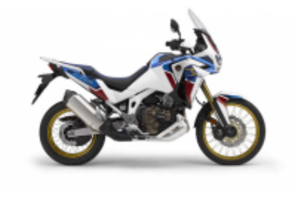
CRF1000L Africa Twin Adventure Sports + ¥67,341