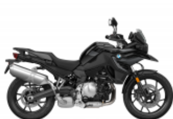
F 750 GS + $0.00