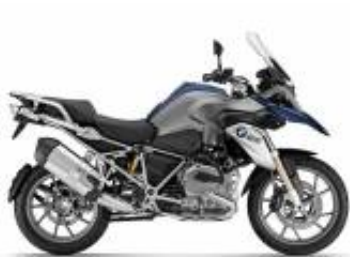
R 1200 GS + $150.00