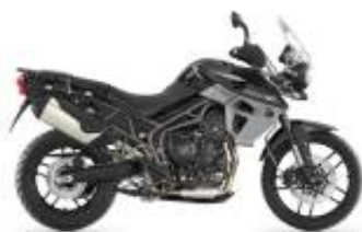
Tiger 800 XRX + 0.00.-