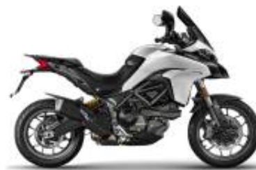
Multistrada 950 V2 + 0.00.-