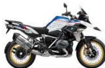
R 1250 GS HP Edition + 0.00.-