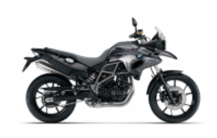
F 700 GS + $0.00