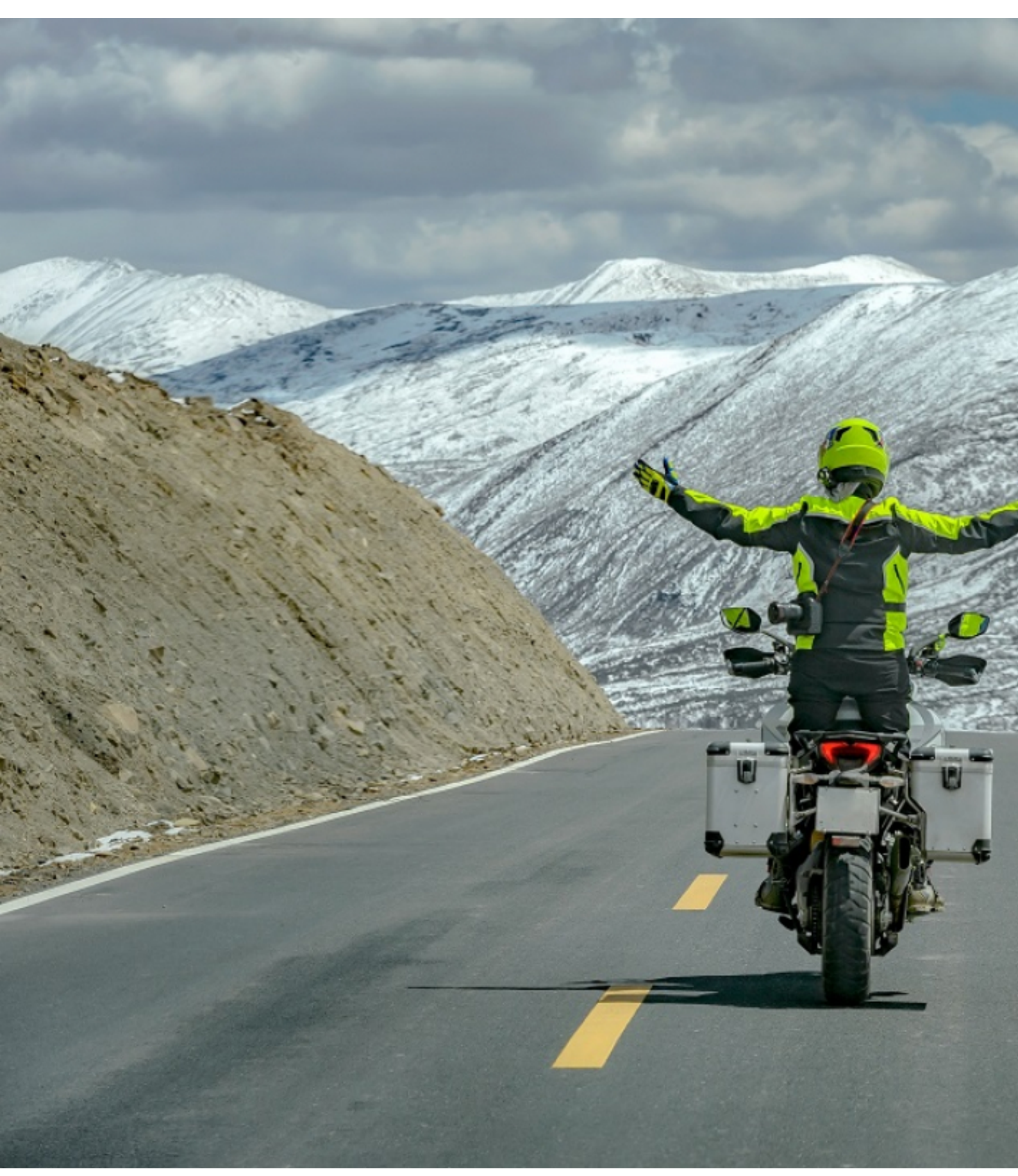
Motorcycle dual-purpose and Adventure Westfjord Viking