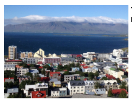
7 - Reykjavík - - End of services, return home