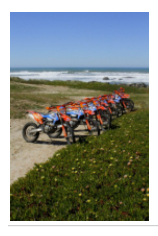
1 - Hotel FeelViana - Hotel FeelViana - 0 Arrival at Porto airport / Transfer to Basecamp / Group dinner (pending on flight arrival time)