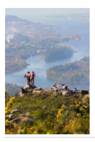
4 - Hotel FeelViana - Hotel FeelViana - 60-120km All-day tour with Professional Guide / Lunch en-route / Transfer to Porto airport / Departure (after 9.15pm)