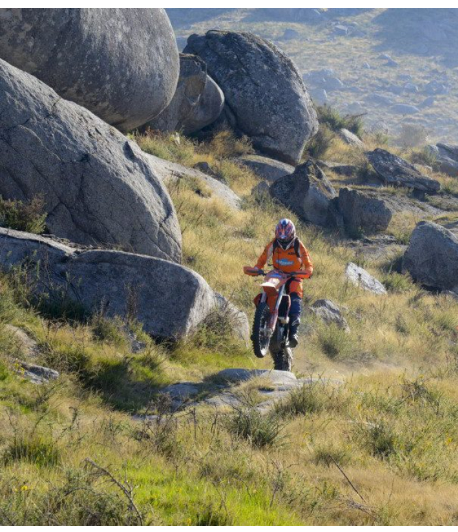
Motorcycle Enduro off Road Tour 4 Days in Costa Verde, Portugal