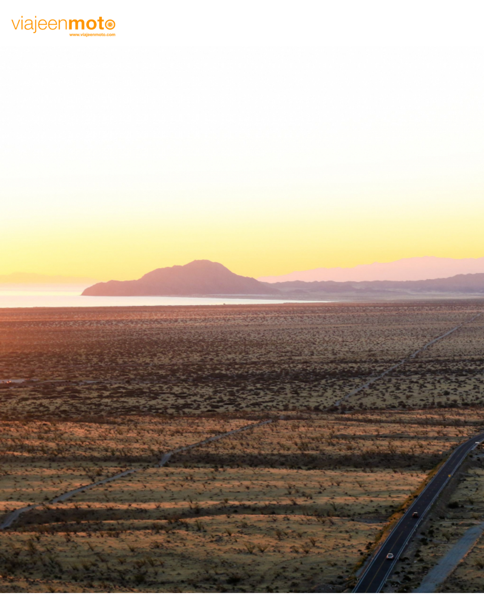
Motorcycle Enduro off Road Tour Baja California Enduro off Road KTM in México (5 days)