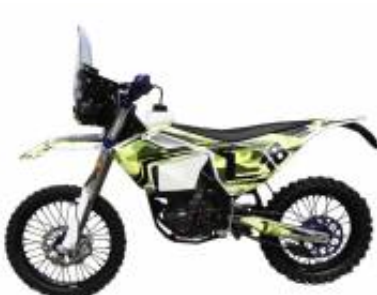
Rally 450 + $0.00