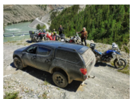
9 - Gorno-Altaysk - Novosibirsk - 450 Road to Novosibirsk, releasing bikes, farewell dinner and final photos. Highlight of the day: Black African bike post.