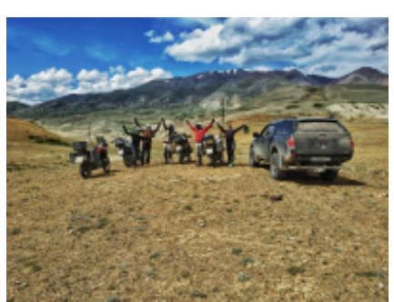
10 - Novosibirsk - - 0 Departure.