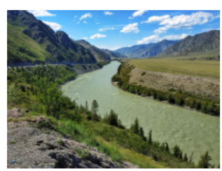
6 - Lake Teletskoye - Aktash, Altai Republic - 180 One of the best road segments that you will remember for long, excellent gravel road going into canyon. Highlight of the day: Katu-Yaryk mountain pass.