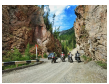
7 - Aktash, Altai Republic - Aktash, Altai Republic - 100 One more rest day or we can do short detours around the venue, visiting Ulugan waterfalls, Geizernoe Lake, Aktach TV tower, The Tarkhatinsky megalithic complex, etc. Highlight of the day: Mars-alike landscapes and geyzer lake