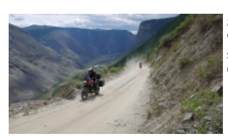
8 - Aktash, Altai Republic - Gorno-Altaysk - 350 With the Chuya Highway we return back to Gorno-Altaysk. Our last night we stay in the cozy eco-hotel on the Katun River. Highlight of the day: Katun and Chuya rivers junction.