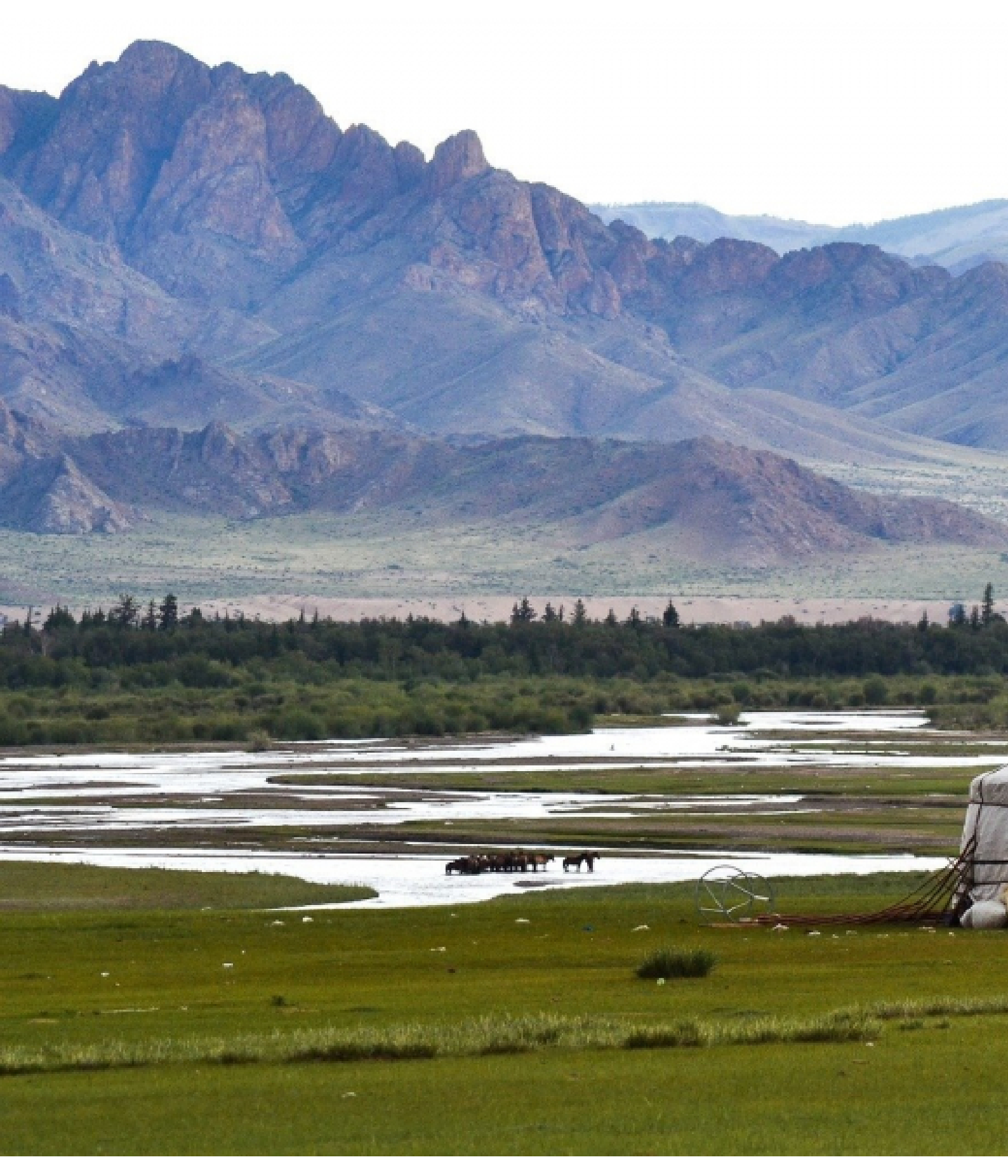
Motorcycle dual-purpose and Adventure, best of Siberia, Altay Mountains and Chuya Highway