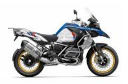
R 1250 GS Adv LC + $429.18