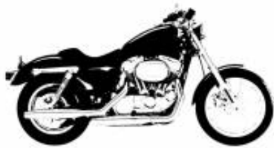
Heritage Softail Cruiser Touring Class + $0.00