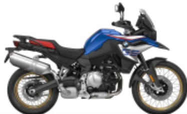
F 850 GS + $296.36