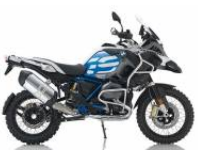
R 1200 GS Adv + $428.25