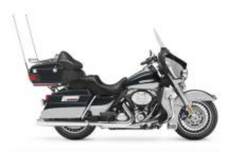
Road Glide Ultra Grand Touring Class + $972.04