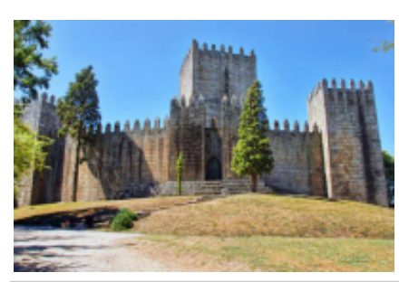
8 - Mira - Mira -

On the roads towards Mira, you will discover different towns, such as Coruche, capital of cork; Santarém, with its rice paddies and vegetable crops; and stop at Batalha, to visit the magnificent monastery of Batalha. Night in Mira.