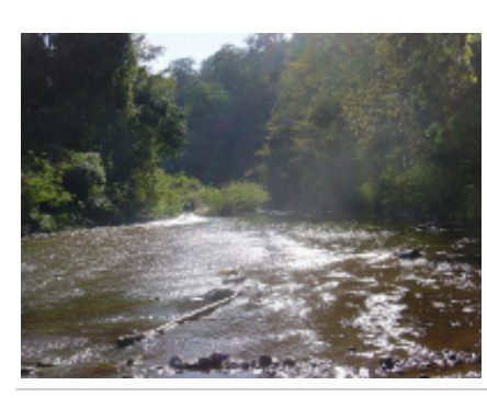
1 - - Nusa Dua -