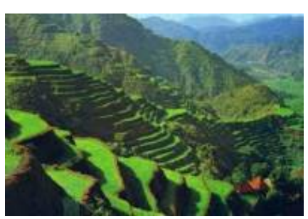
6 - - Kintamani -