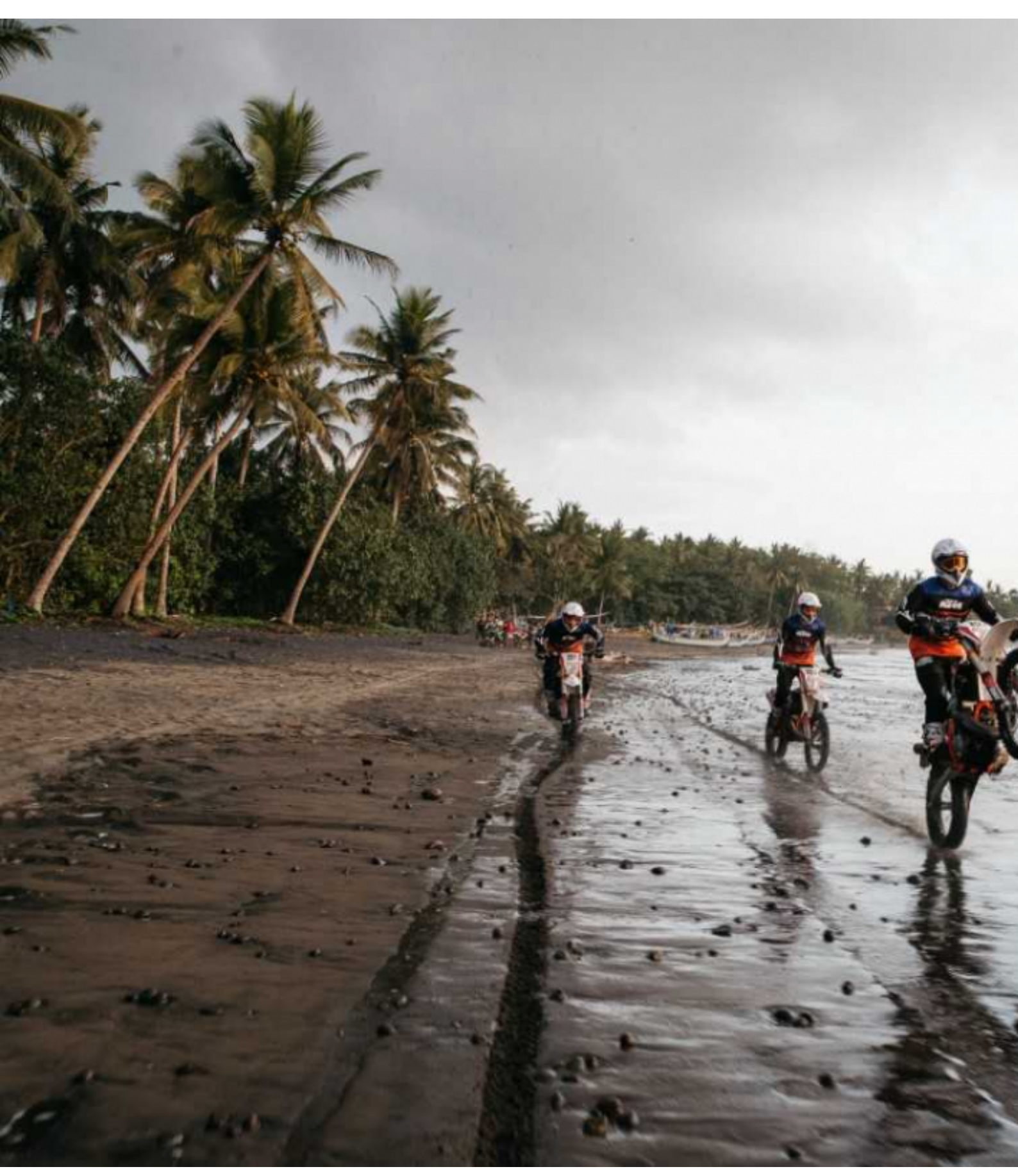
Motorcycle Enduro off Road Tour Bali