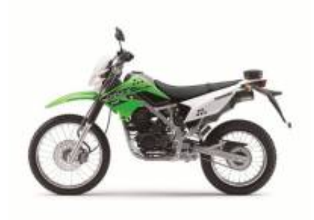
KLX 150 + $0.00