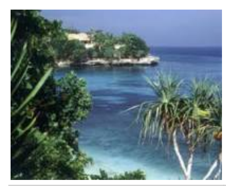
3 - Pekutatan - Negara -