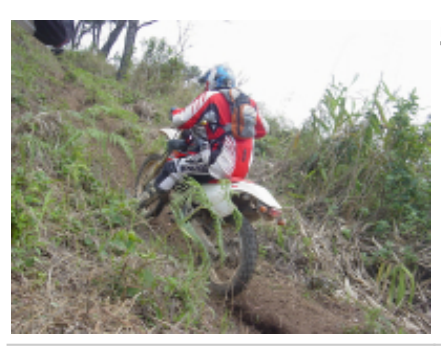
5 - Tabanan - Tabanan -