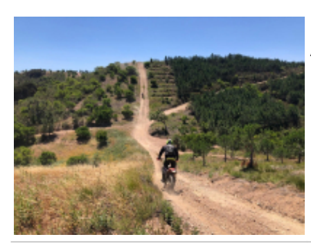
1 - Faro - Faro - 0

Arrival at Faro airport and transfert to ypour hotel, tomorrow we start with the